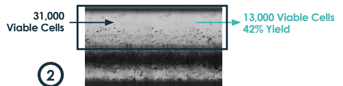
Real time images generated by the LeviCell system showing levitation of viable cells in the top vs dead cells and debris separated in the bottom.

Make use of every sample in your freezer, regardless of the number of viable cells present or starting quality. Only with the LeviCell systems.